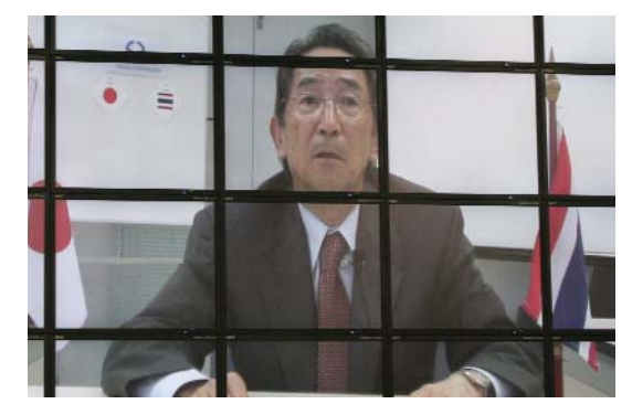
Osaka University President Miyahara greeting PRAGMA 11 participants from Bangkok—courtesy of Teri Simas, UCSD.

sumer cameras and Scalable Adaptive Graphics Environment (SAGE) driven tile displays. The video streams were transmitted at 1080i and 25 frames per second along with audio and the streams used approximately 25 Mbits per second of network bandwidth in each direction. The test was successful as the video quality was flawless and there were no packet